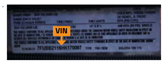
Vehicle Placard (Example)

VIN # & TIRE Inflation Pressure Label Information Location SKEETER Custom Trailer's VIN number begins with 7FUBB