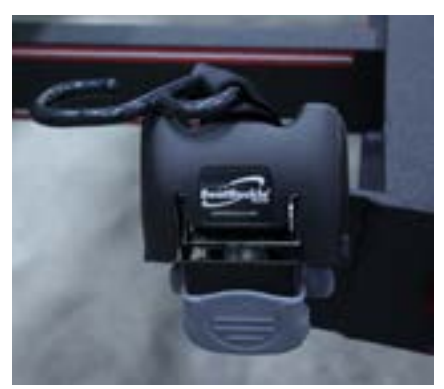
Winch Adjustment and Use